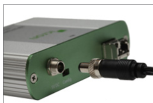
Locking Power Connector